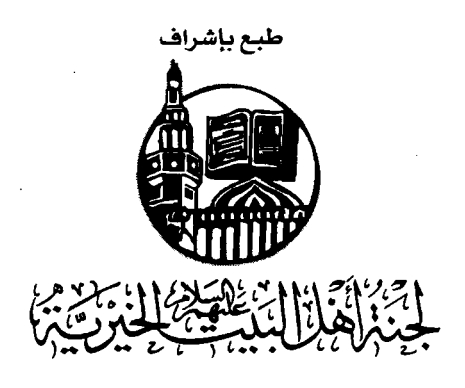
ت: ۲۵۲۲۴۴ - ف: ۸۶۶۳۲۵۲