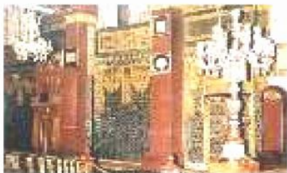
مدرسة السيدة فاطمة (MADRASSA)

The rights of Imam Ali were denied. The message of Ghadeer was forgotten. Imam Ali (AS) remembered the Prophet's words and knew that he must be patient. If he rose up for his rights, there would be civil war. Islam, still in its infancy, would be in danger. So he retired to his house, to save Islam.