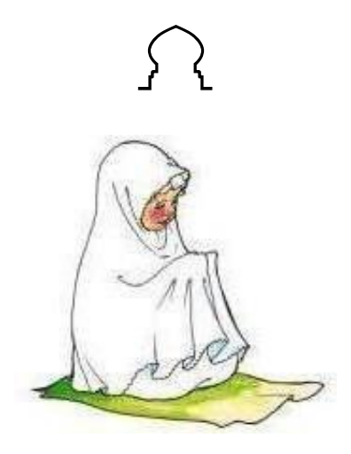
∢ Worship ['ibādah] and Servitude ['ubūdiyyah] ≯